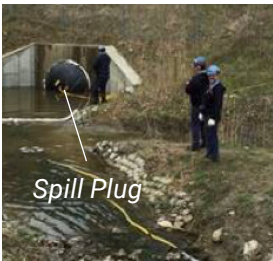
Lubrizol spill plug used to contain spill to storm ditch from Dyson property