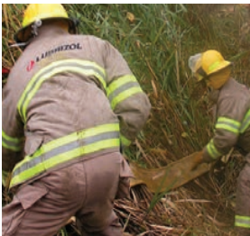
Lubrizol responders pull fire hose to the 2007 CSX derailment/fire.