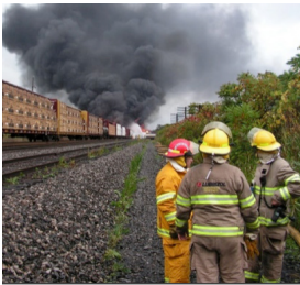
Lubrizol responders pull fire hose to the 2007 CSX derailment / fire.