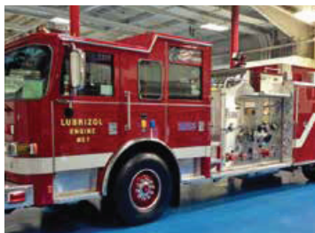
New State-of-the-Art Fire Engine

Lubrizol's emergency response organization is made up of more than 130 firefighters across four shifts, providing round-the-clock protection available to all of Lake County.