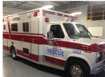
State Licensed Ambulance