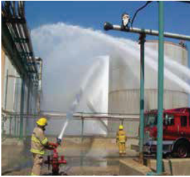
Firefighters are providing cooling for a simulated tank farm fire.