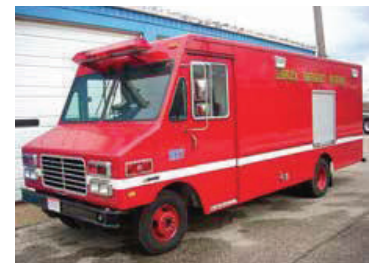
Technical Rescue Vehicle