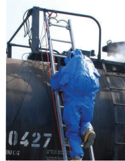
Left: Hazard material technician in Lake County emergency preparedness drill trains to fix a leaking tank car.

We train side-by-side with local emergency responders to ensure teamwork and coordination among those responding to emergencies. Local fire departments and training centers (e.g., Auburn Career Center) also utilize Lubrizol's fire training grounds. Emergency responders attend more than 24 hours annually of specialized training. Responders also attend extensive training at Bowling Green State Fire School, Colorado HazMat School and Texas A&M Firefighting School.